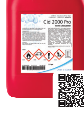
water line cleaner