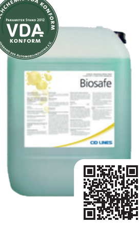
foaming alkaline cleaner, safe on the softest metals