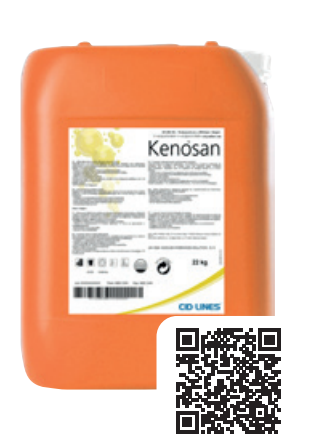
foaming alkaline degreaser with superior cleaning properties